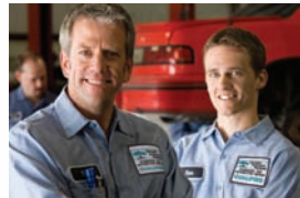
Motorist Assurance Program